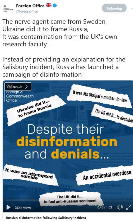
Fig 4: FCO campaign to discredit Russian MFA as a credible source

turning the opponent's communication style against itself: amplifying contradictions and inconsistencies in his/her message, exposing the pattern of falsehoods disseminated through his/her channels of communication, and maximising the impact of the counter-narrative via the opponent's 'network of networks'.