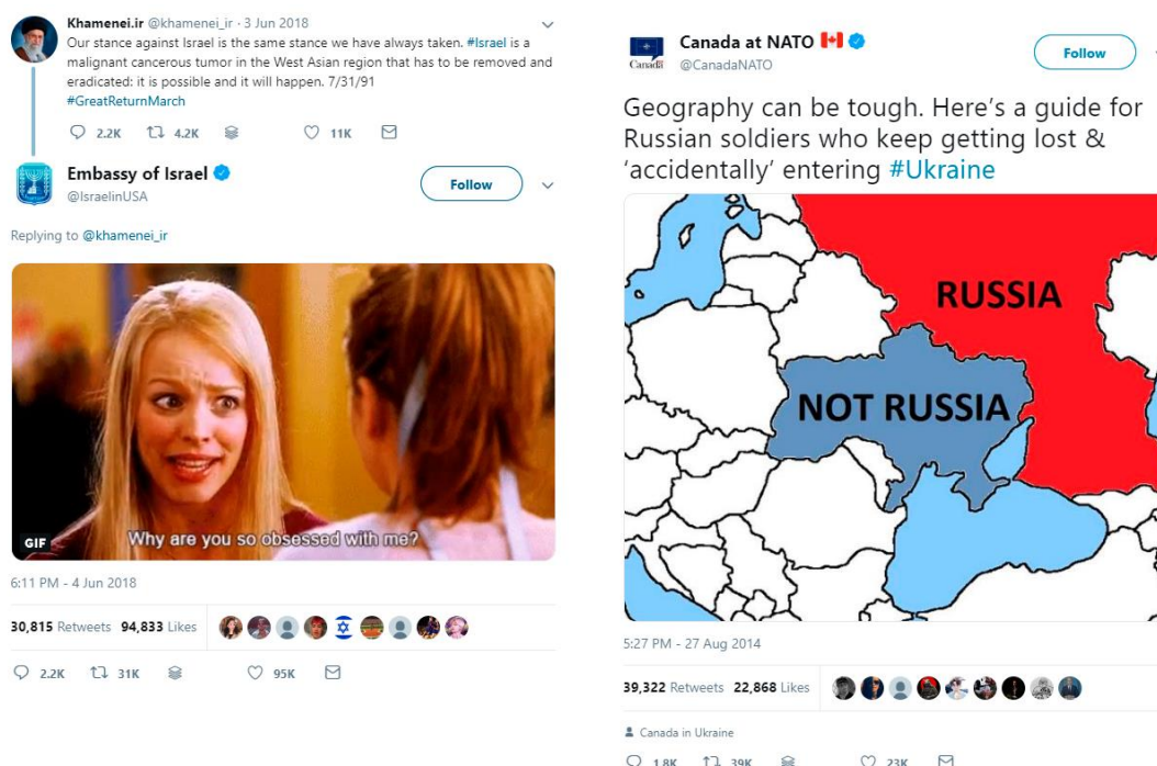
Fig 3: Using humour to discredit opponents and their policies