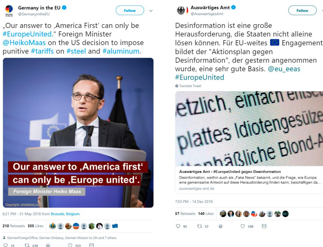
Fig 2: #EuropeUnited campaign by the German MFA