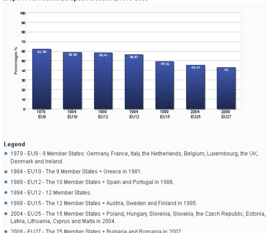
Graph 1. Turnout at European elections, 1979-2009

Source: European Parliament Website, www.europarl.europa.eu .