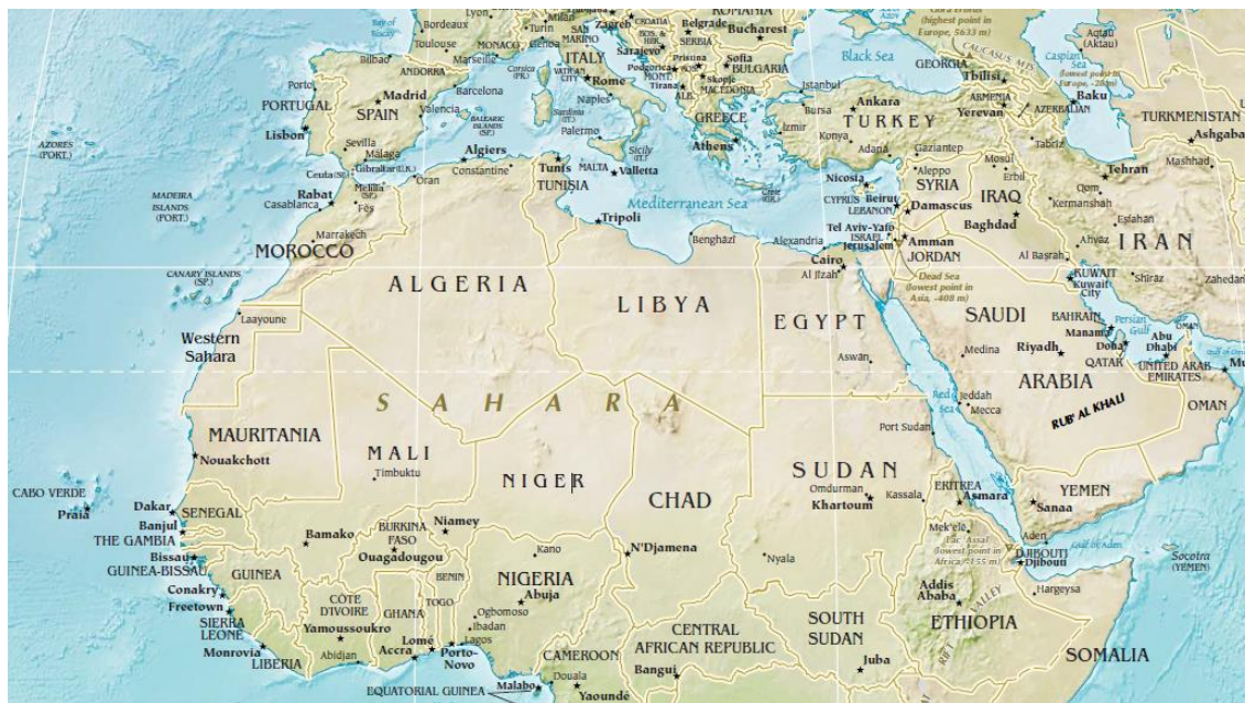
Figure 1. The South